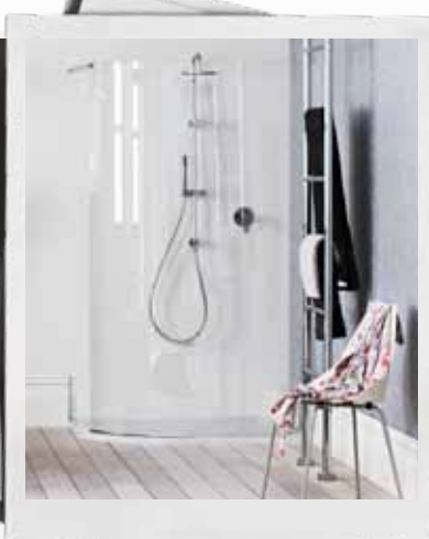
'Mizu' wetroom shower system (left), $1708, 'Kado Arc' walk-in shower (above), $1551, Reece. >