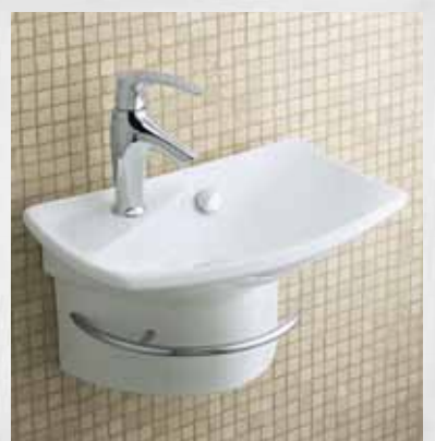
Kohler 'Escale' 500mm hand basin, $785, Tradelink.